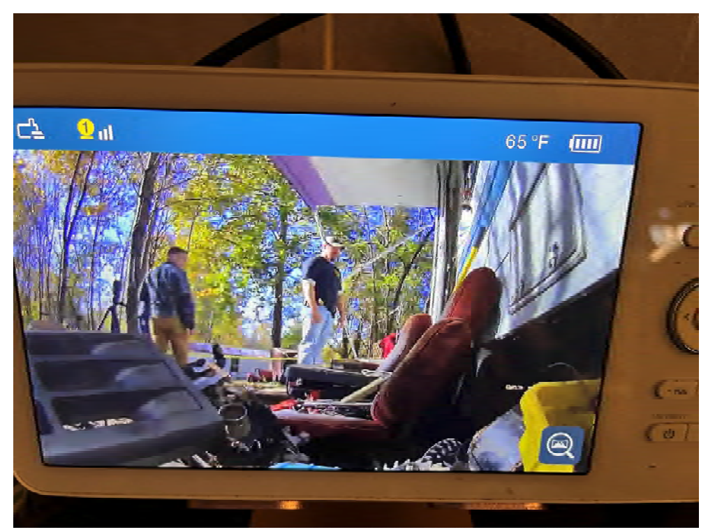
Image 7. Viewpoint of baby monitor found near the foot of the bed (SA Craig Call shown on porch)

SA Austin observed a suspected bullet hole in the exterior of the trailer to the left of the front door. This was labeled as ballistic event 1.0 (BE 1.0) for documentation and identification. The bullet that created BE 1.0 perforated the trailer wall and entered the interior of the trailer through a wooden wall by the front door at BE 1.1. A lead in mark was observed on the left of the hole on the outside of the trailer and splintered wood was inside of the trailer. Both were consistent with a shot origin from the yard to the left of the trailer door. A second BE (BE 2.0) was located in a cupboard above the couch. The bullet from BE 2.0 passed through the cupboard, exited at BE 2.1, and made an oblong hole in the rear wall of the trailer at BE 2.2. Trajectory rods were placed through the two series of BEs, photographed, and documented through the 3D scans. The information from the scans was used to create trajectory cones with 5° margins of error<sup>2</sup> (see image 7 above). No projectiles were collected from either of these flight paths.