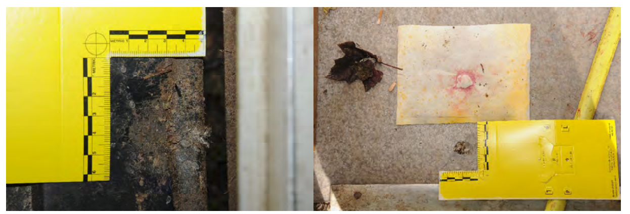
Images 3-6: Suspected shotgun damage and positive sodium rhodizonate to trailer floor by front door

This document is the property of the Ohio Bureau of Criminal Investigation and is confidential in nature. Neither the document nor its contents are to be disseminated outside your agency except as provided by law - a statute, an administrative rule, or any rule of procedure.