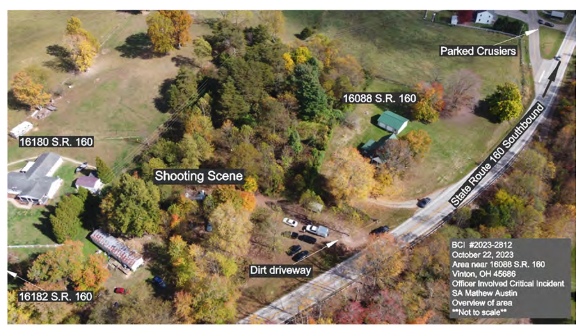
Image 1. Overall diagram of scene area created from drone photograph

SA Austin arrived at the scene at approximately 1230 hours. Crime scene tape, multiple cruisers, and uniformed law enforcement secured the dirt driveway to the property. The property and driveway were found to be between the addresses of 16182 and 16088 on State Route 160. A search warrant for the property had not yet been obtained; SA Austin parked in the driveway and documented the overall area with a drone flown above the roadway (see below). SA Austin also photographed two cruisers further south on SR 160 that were reportedly parked by deputies, before they walked to the trailer to attempt to execute the original arrest warrant.